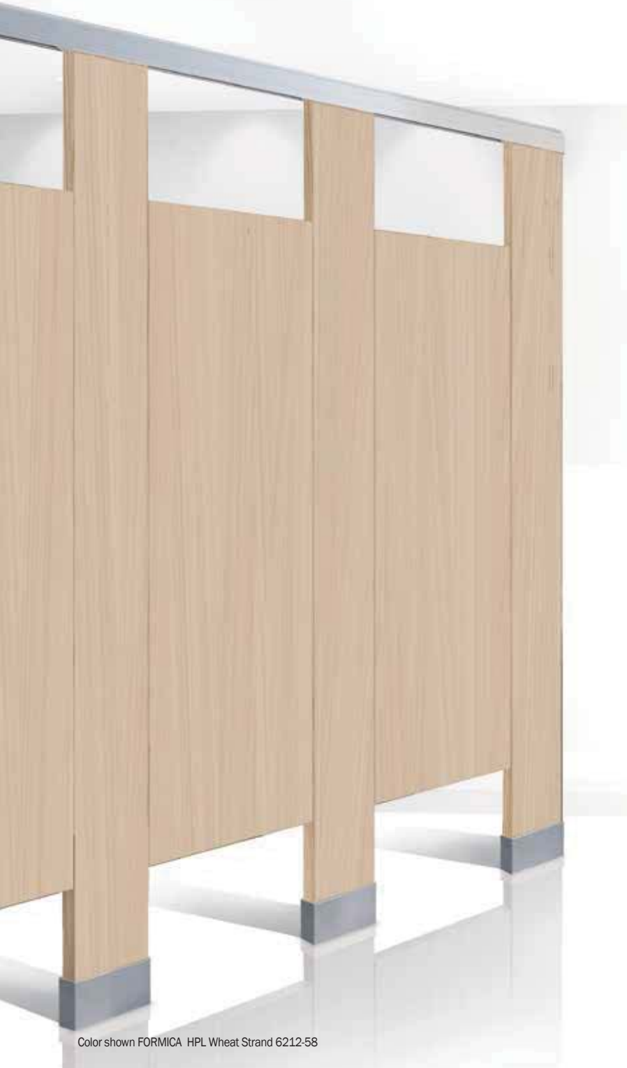
Color shown FORMICA HPL Wheat Strand 6212-58