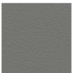
Charcoal Gray (M248)